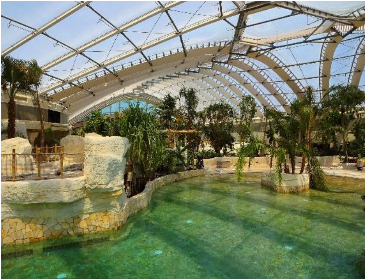
Figure 2: Center Parcs du Bois aux Daims, Vienne, 2015 – inside view [12]