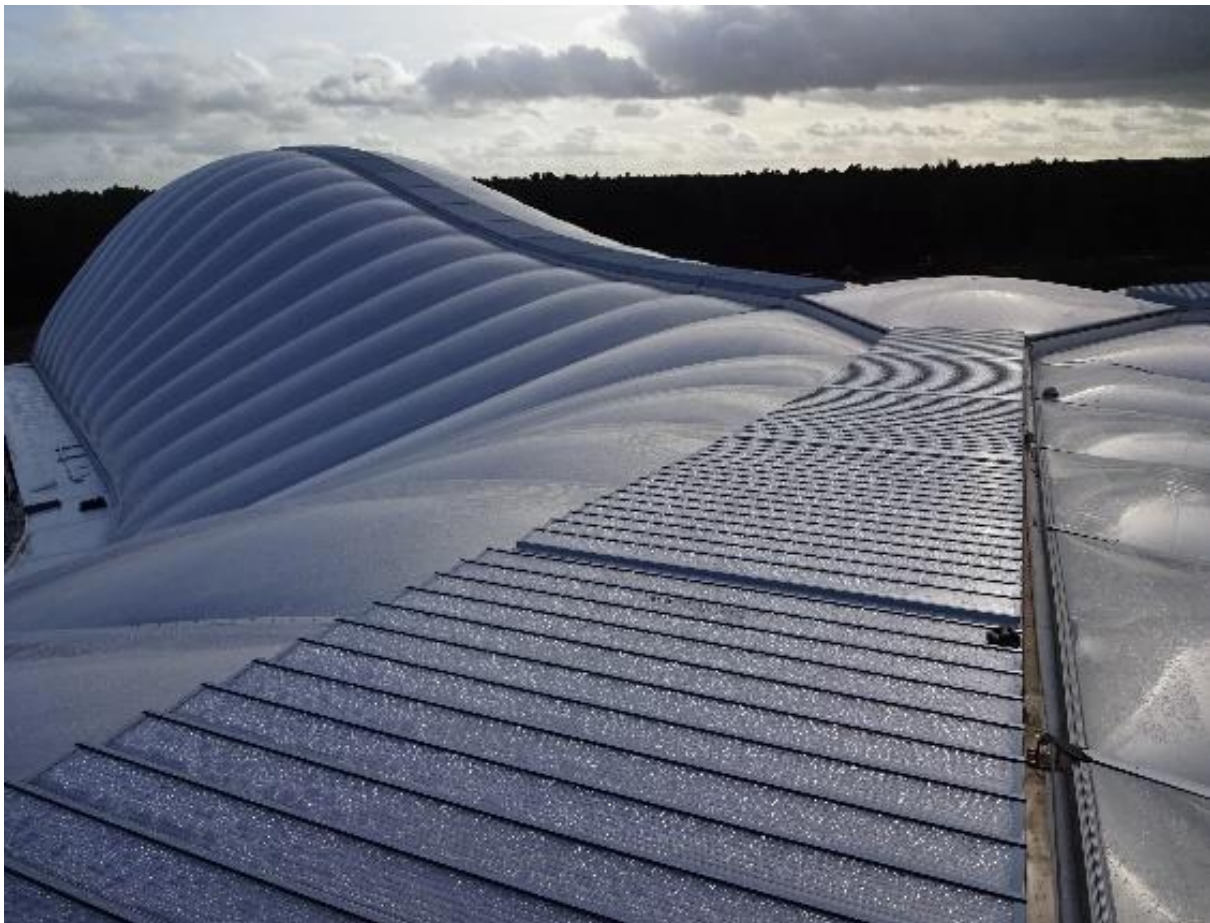
Figure 1: Center Parcs du Bois aux Daims, Vienne, 2016 – outside view [12]